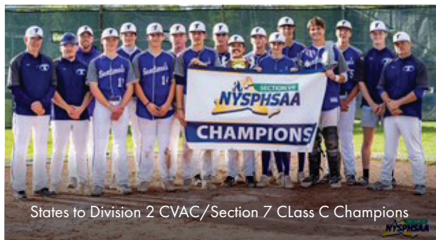
States to Division 2 CVAC/Section 7 Class C Champions