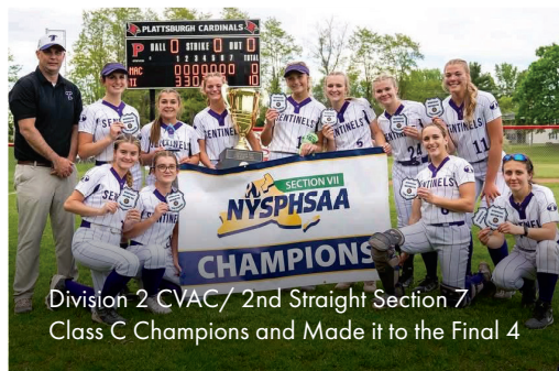
Division 2 CVAC/ 2nd Straight Section 7 Class C Champions and Made it to the Final 4