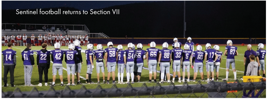
Sentinel football returns to Section VII