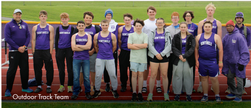
Outdoor Track Team