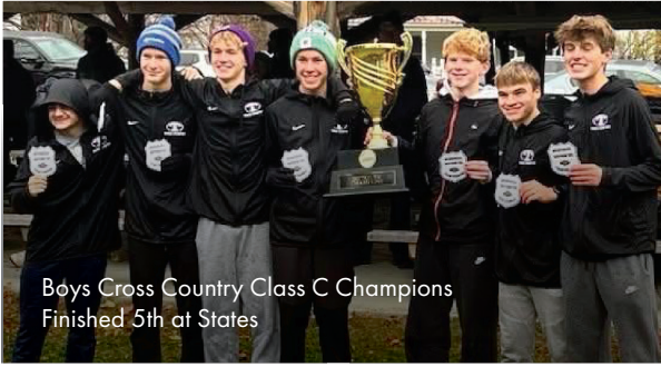
Boys Cross Country Class C Champions Finished 5th at States