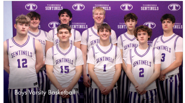
Boys Varsity Basketball