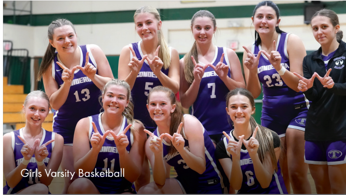
Girls Varsity Basketball