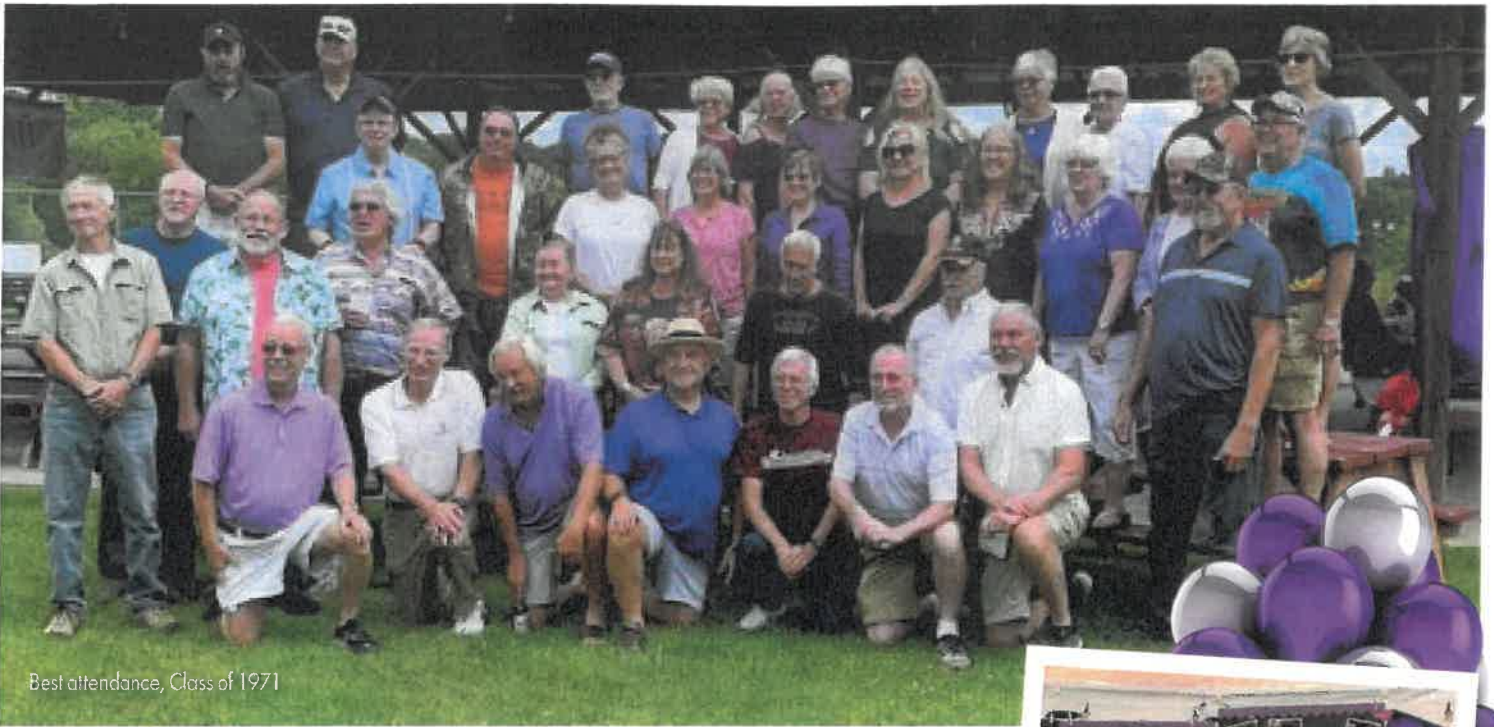
Best attendance, Class of 1971