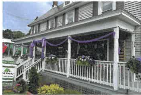
Country Florist Sentinel Spirit Business