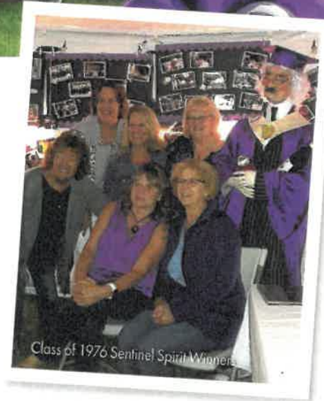
Class of 1976 Sentinel Spirit Winners