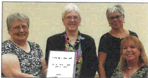
The Ticonderoga Festival Guild has had a long tradition

of advancing the Performing and Creative Arts in the Ticonderoga area, and in doing so, has helped entertain, inform and inspire a countless number of residents and visitors. Through the efforts of Guild members, many of whom are Ticonderoga Alumni, our "neck of the woods" has become known for its rich and vibrant arts scene. Young and old alike have been able to participate in and enjoy the benefits of a life lived with culture and art.